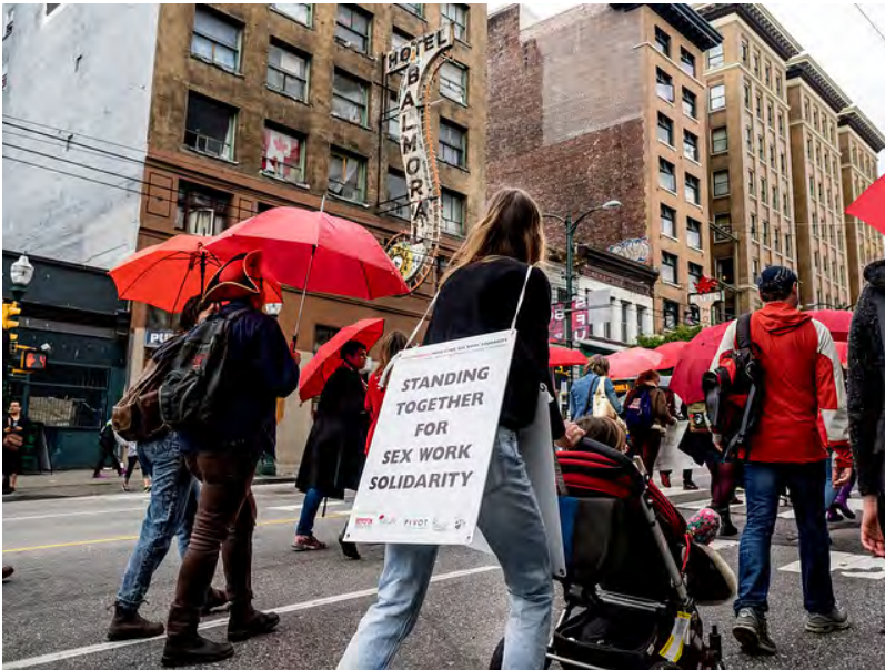
Red Umbrella March for Sex Work Solidarity